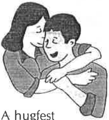
A hugfest (the opposite of a slugfest)