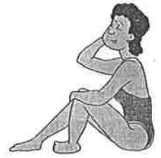
Sweltering and sluggish