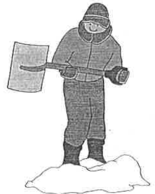
Not sweltering, not sluggish, and not jovial at all