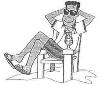
Sweltering and sluggish but jovial