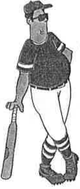
A nonchalant slugger