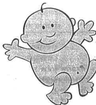
An example of a vulnerable baby

capable of being hurt emotionally or physically; easily hurt [Babies need protection because they are so vulnerable .]