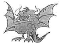
An example of one of the monsters that are most definitely not in the closet!

Bedtime. All children procrastinate—or worse—when bedtime is announced. "Mom lets us stay up 'til three" is a test to see how gullible the sitter is. A good sitter will not be fooled. Also, there is no monster in the closet. A good sitter will not be unnerved by claims that there is. A night light can diminish bedtime fears.